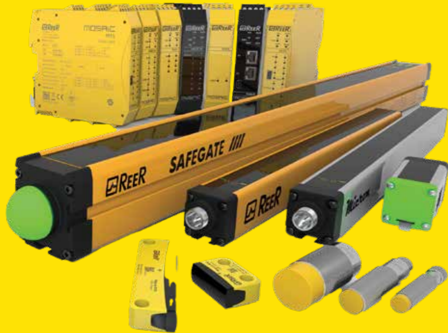
Safety Light Curtains