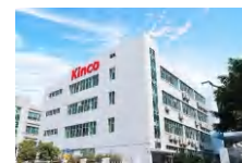
Shenzhen Manufacturing Center