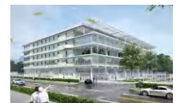
Changzhou Manufacturing Center